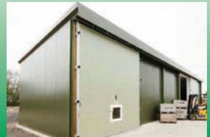
▲ External Stores