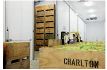
▲ CA Stores

60 years' experience in the fruit, vegetable and salad industry enables ICA to offer the option of a complete or selected package service.