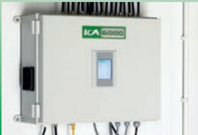
▲ CA Control Systems

Lawrence House, Transfesa Road, Paddock Wood, Kent TN12 6UT